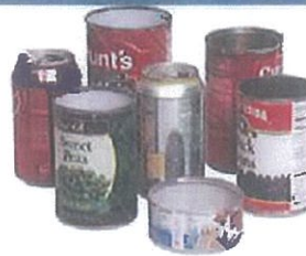
Aluminum, Steel & Tin Containers Latas de Aluminio, Acero y Estaño