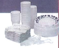
Paper, Plastic & Styrofoam Serving Items Platos, Tazas y Utensilios de Servir de Papel, Poliestireno y Plástico

More "No" Materials: ceramics, dishes, coffee mugs, drinking glasses, light bulbs, Pyrex, flammable, toxic, hazardous, medical waste and syringes