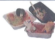
Food & Wet Waste Comida y Desperdicios Húmedos