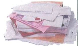
Mixed Paper Papel Mixto