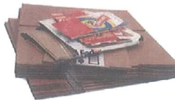
Corrugated Cardboard & Boxboard Cajas de Cartón & Cartulina Gris