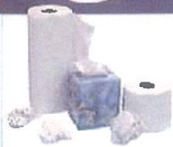
Paper Towels, Facial Tissue & Toilet Tissue Toallas de Papel, Papel de Seda y Papel Higiénico