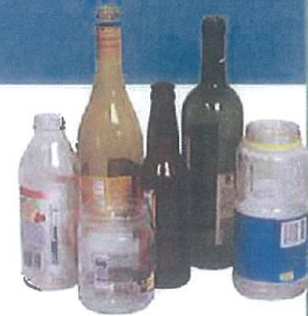
Glass Bottles & Containers Botellas y Envases de Vidrio