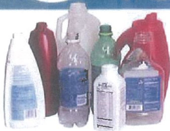
Plastic Containers #1 through #7 (No Styrofoam) Recipientes de Plástico Número Uno hasta Siete (No Poliestireno)