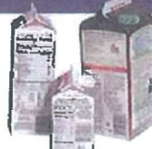
Wax-Coated Paper Drink Containers Recipientes de Papel Encerado para Bebidas