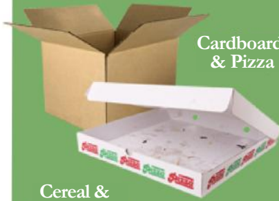
Cardboard Boxes & Pizza Boxes